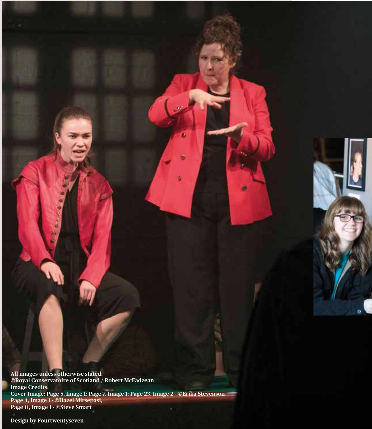
All images unless otherwise stated: ©Royal Conservatoire of Scotland / Robert McFadzean Image Credits: Cover Image; Page 5, Image 1; Page 7, Image 1; Page 23, Image 2 - ©Erika Stevenson Page 4, Image 1 - ©Hazel Mirsepasi, Page 11, Image 1 - ©Steve Smart